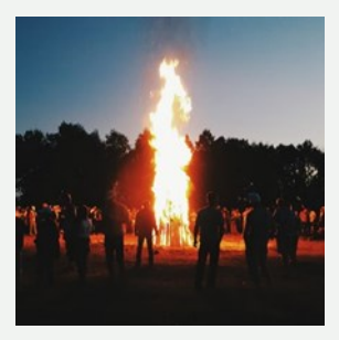
"Adios old Christmas trees!"

Germans celebrate Easter with a bonfire?